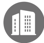
C&I energy storage