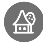
Rural power shortage