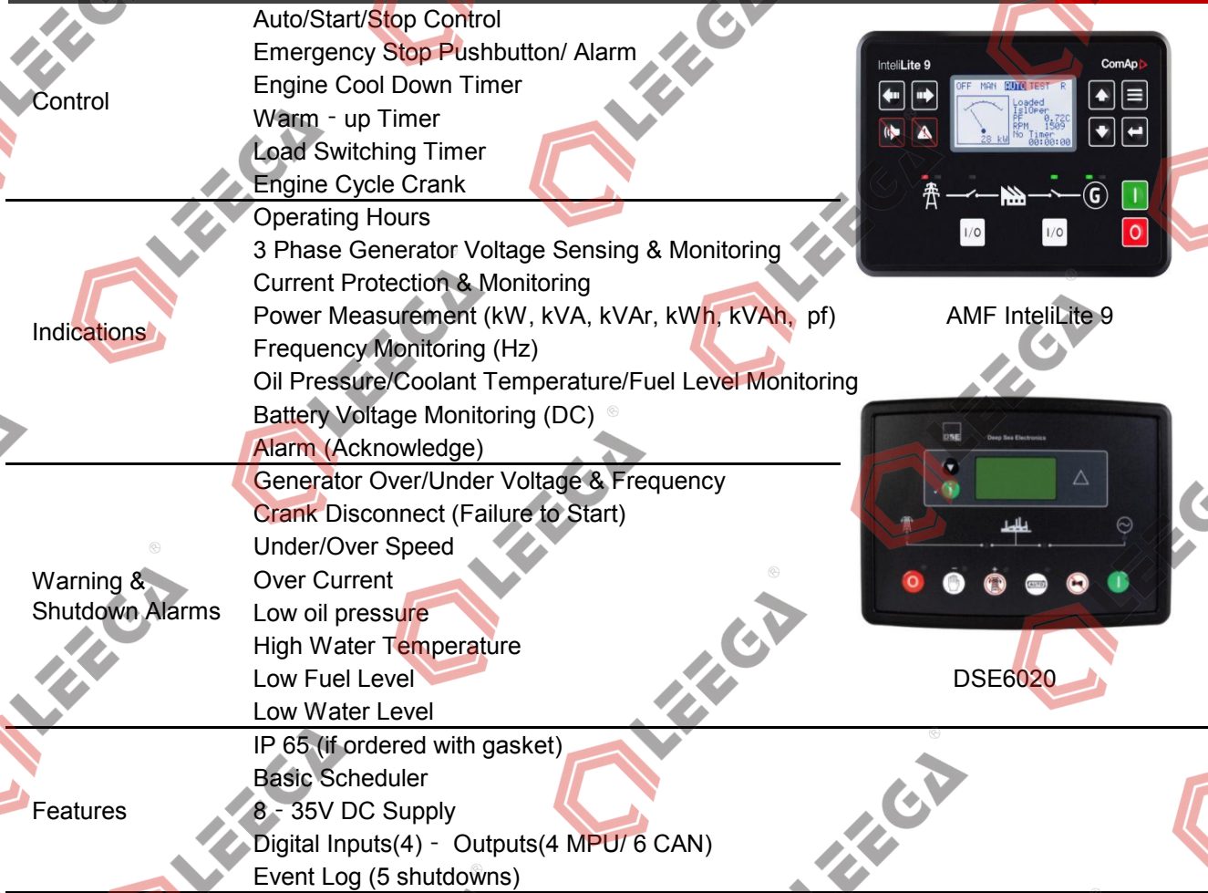
AMF IntelliLite 9