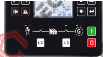
AMF InteliLite 9