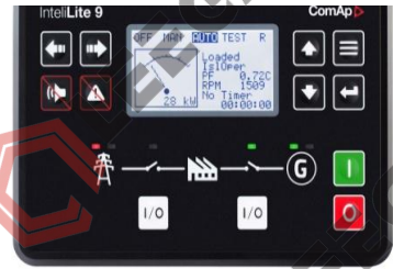
AMF IntelliLite 9