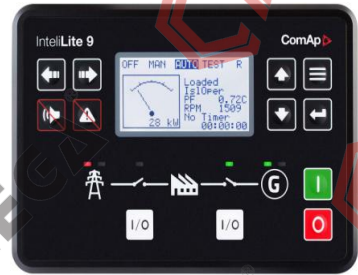
AMF IntelliLite 9