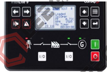
AMF InteliLite 9