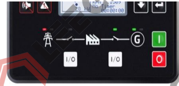
AMF InteliLite 9