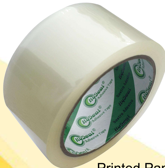
Printed Paper Core