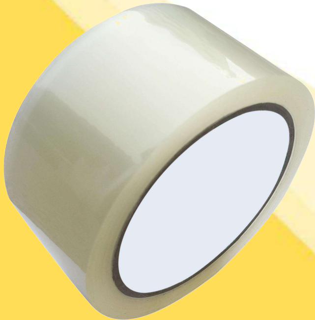
Plain Paper Core

Paper Core: plain or printed (max. two colors)