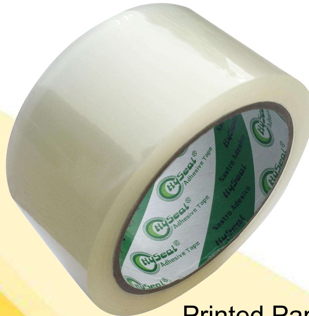
Printed Paper Core