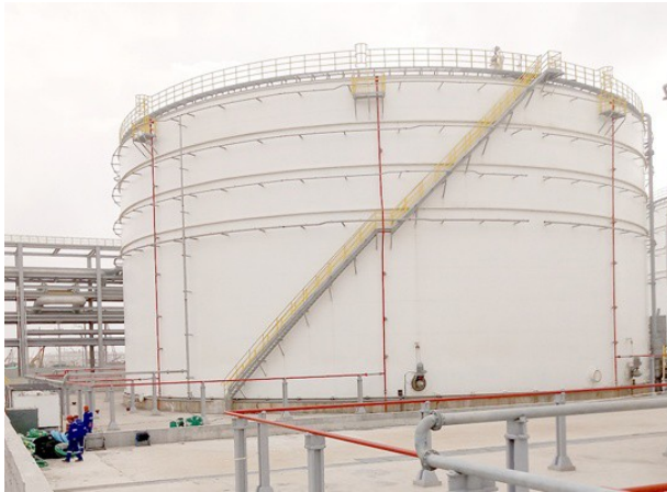
Typical inner floating roof product oil storage tank