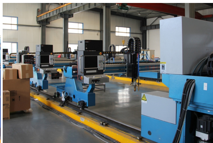
Gantry plasma cutting machine lines