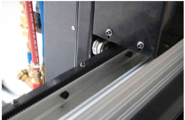
Honeybee Power series cutting machine parameters