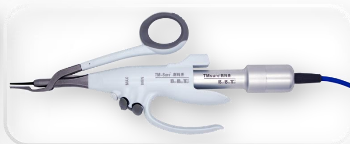
Ultrasonic scalpel 超声刀

The BBT ultrasonic Generator is also called the ultrasonic energy platform,