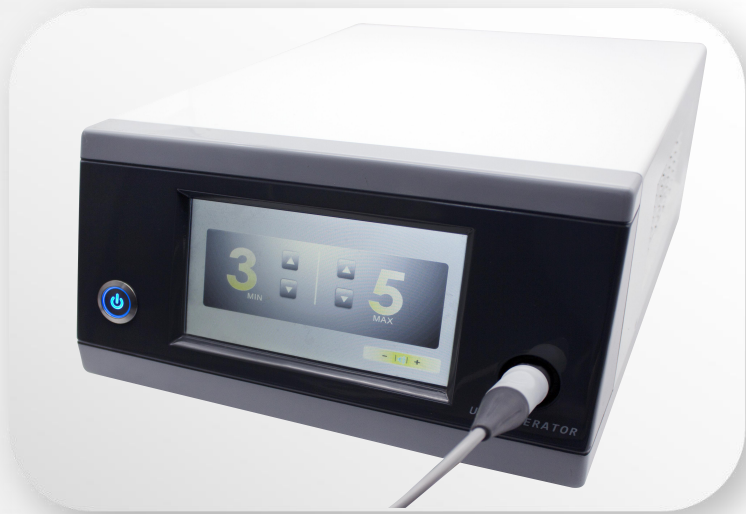
BBT Coagulation & Dissection energy platform