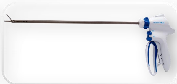
Ultrasonic scalpel 超声刀

The BBT ultrasonic Generator is also called the ultrasonic energy platform,