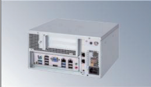
IBX-501F Wall-mounted industrial case